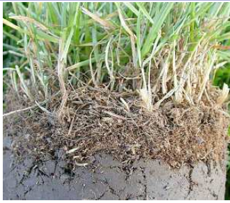
Thatch build up can suffocate roots and harbor pests.